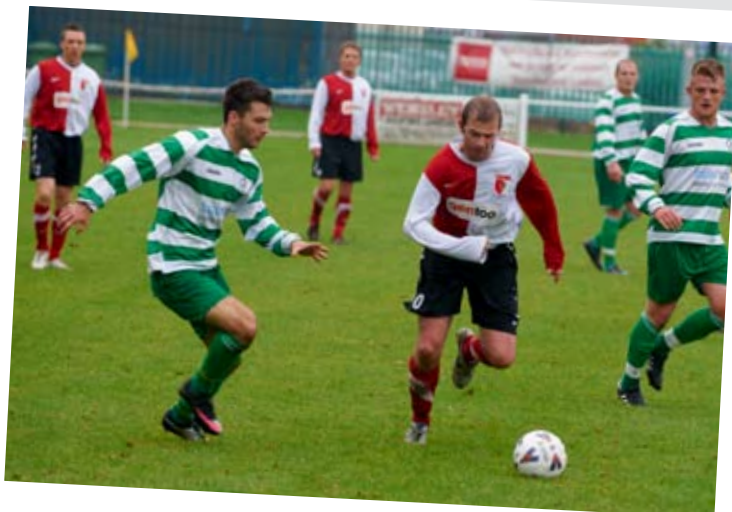
Smithy chasing hard