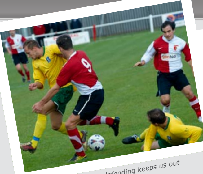
Desperate defending keeps us out